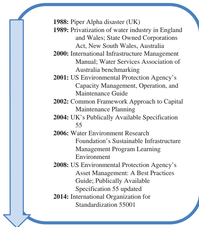
Figure 3 Evolution of Asset Management, adapted from [5].

If there are doubts, each questionnaire is accompanied by a document explaining what is expected in each statement. The following table (Table 1) presents the 25 stages that make up the several questionnaires on which the diagnostic model is based, with the respective maximum and minimum scores. Those scores are related with the minimum score to implement the ISO 55001 on the corresponding stage, and the maximum score corresponds to the highest score that can be achieved.