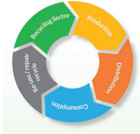
Figure 2 Circular Economy [1].

The circular economy is based on three principles, each addressing the challenges of the resources and systems facing industrial economies: