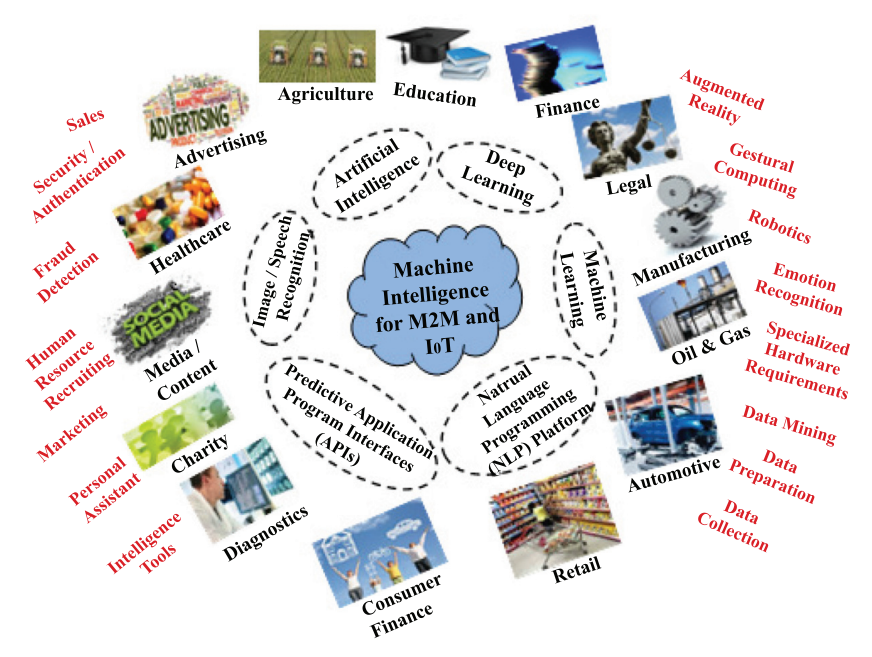
Figure 2 Machine intelligence perspectives for IoT through M2M with Cyber Security.

There are great prospects of development and applications in IoT, which can be applied in almost every aspect of human life, such as environmental